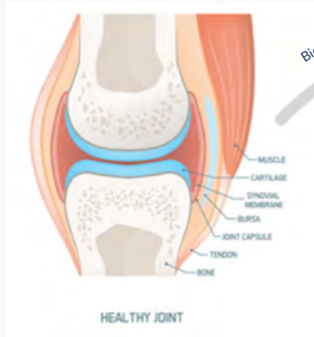
Healthy young joint