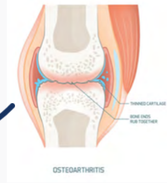
Ageing unhealthy synovial fluid